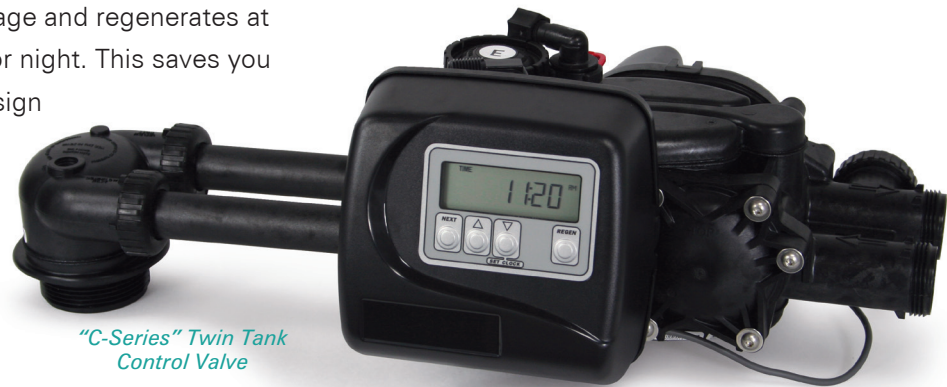
"C-Series" Twin Tank Control Valve

"C-Series" Twin Softener Shown with Optional Bypass & Decorative Tank Sweat Jackets